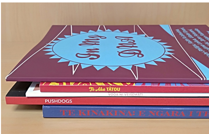
ABOVE The eight books published in 2021 as part of our Writers in Communities projects.