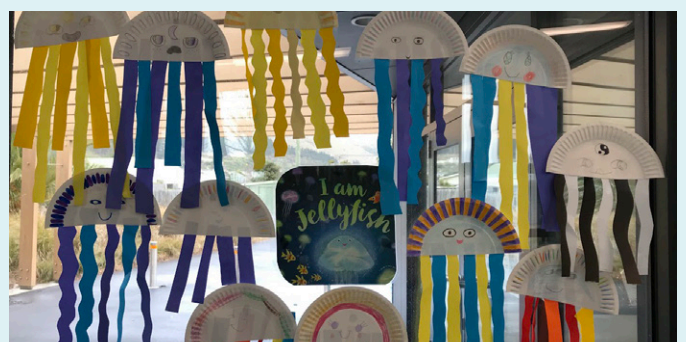
After a visit from author and illustrator Ruth Paul at Sumner School.

Collaboration with sector partners to support important initiatives such as the establishment of the inaugural Te Awhi Rito Reading Ambassador, various literary festivals and events, arts internships for tertiary students, and resources for New Zealand books in the classroom.