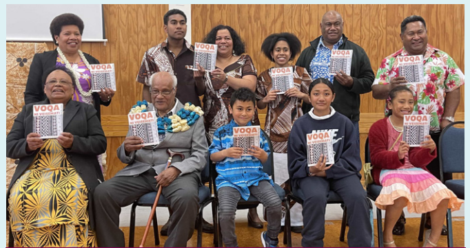
The authors at the launch of their Writers in Communities book Voqa Ni Veisemati , for Fijian Language Week, in Johnsonville, Wellington.

A successful online Reading Challenge over the 2020-2021 summer holidays, pairing up with the SPCA to encourage Kiwi kids aged 5 and up to read to their pets (real or toy!) and log their summer books.