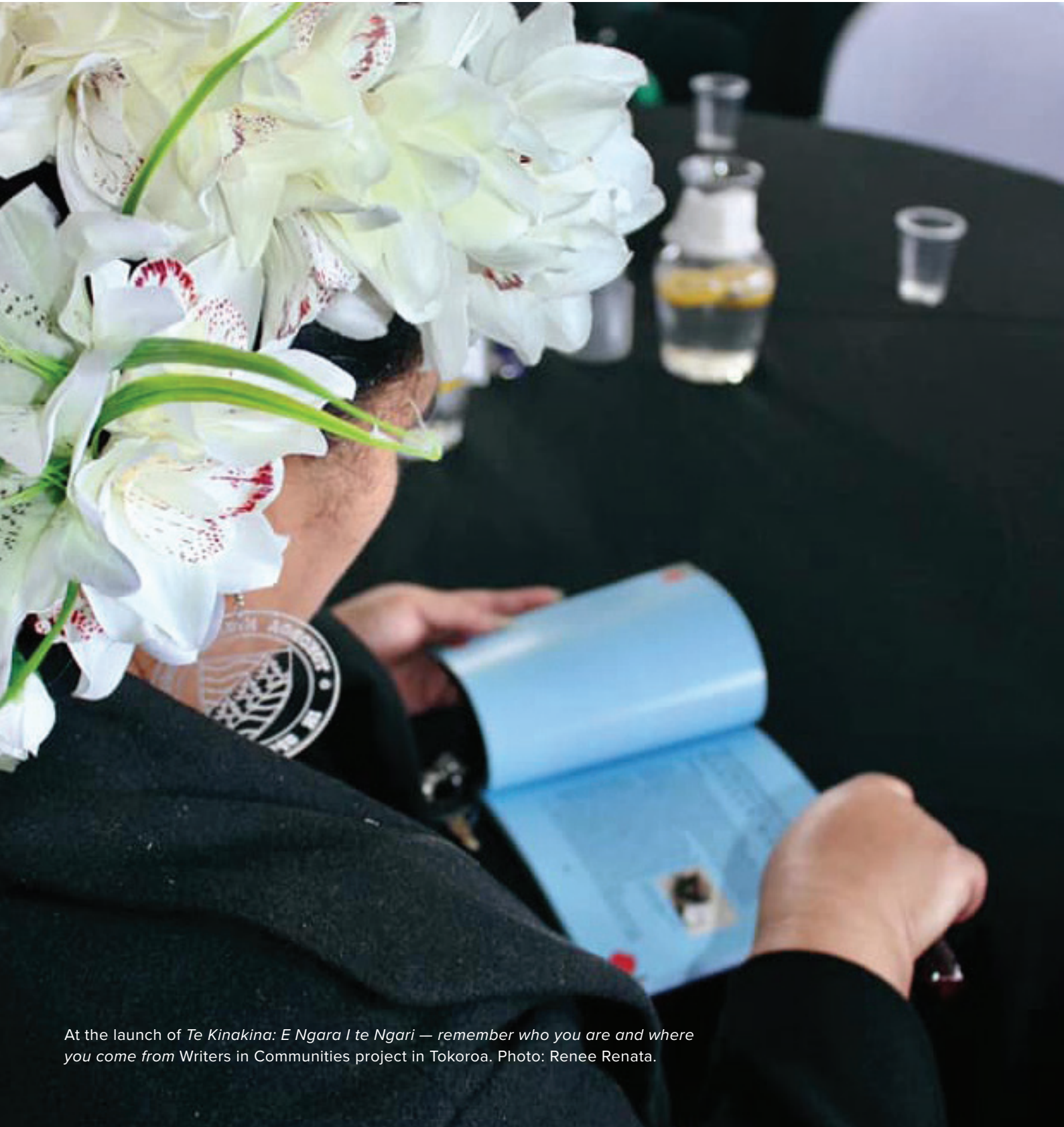
At the launch of Te Kinakina: E Ngara I te Ngari — remember who you are and where you come from Writers in Communities project in Tokoroa.