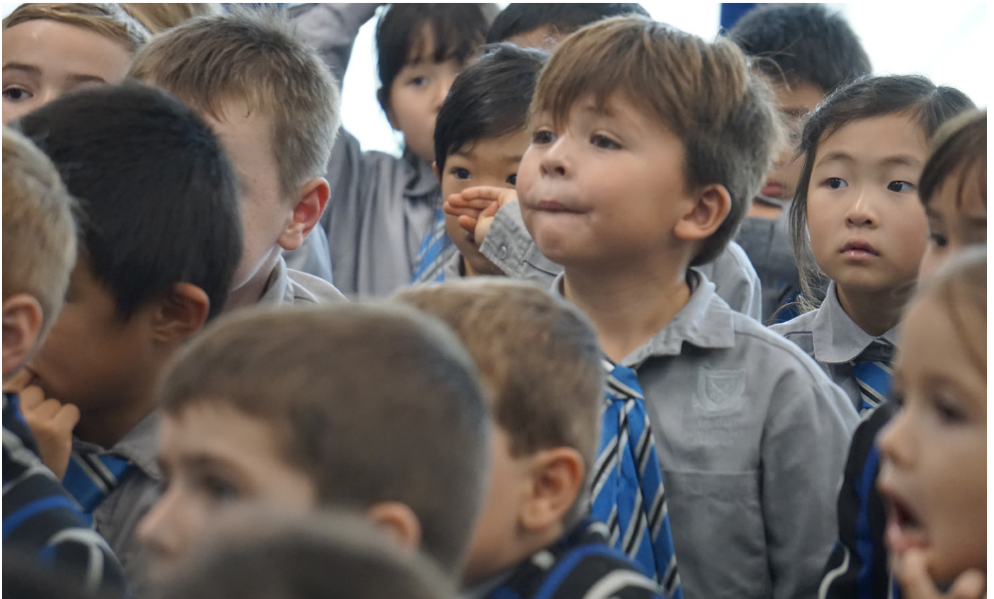
ABOVE Children at Southwell School enjoy a Writers in Schools visit by Gavin Bishop.