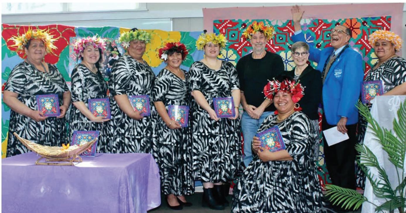
ABOVE At the launch of Te Kinakina in Tokoroa.