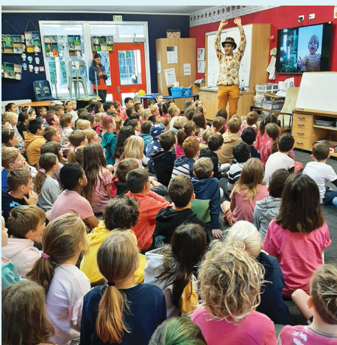
Author Donovan Bixley visits students at Kapakapanui School for Writers in Schools.

We delivered 199 New Zealand books free of charge to young readers and published 132 reviews online. We also held six reviewing workshops in schools across the motu.